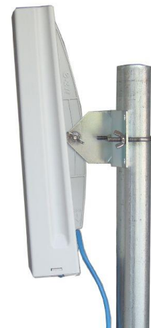
EZ-Bridge-LT+HD™ tool-less installation